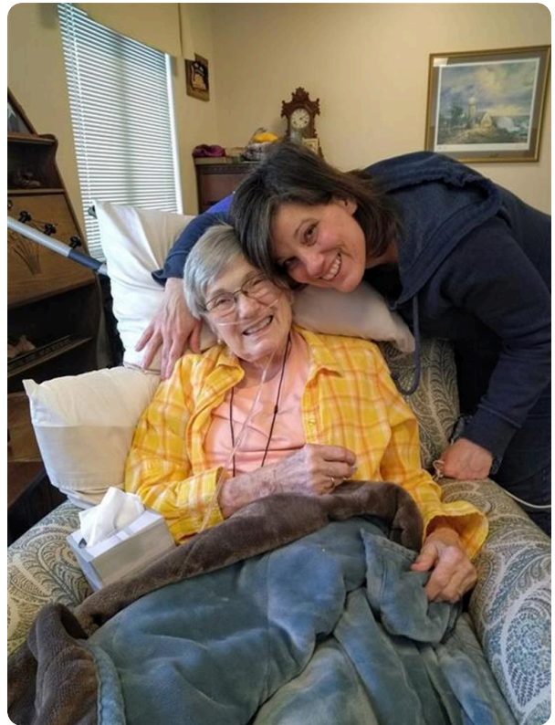
With daughter Kris in February 2021